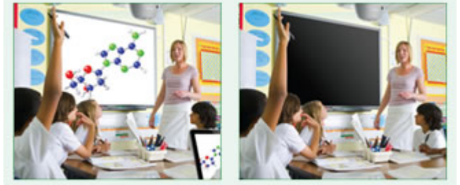
Eco AV mute off 100% power consumption

Stay in control of your presentation with the Eco AV mute feature. Direct your audience's attention away from the screen by blanking the image when no longer needed. This also instantly reduces the power consumption to 30%, further prolonging the life of your lamp